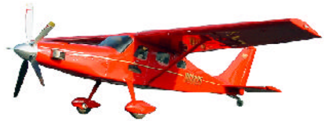
COMP AIR 7 Turboprop 657 SHP Walter M601D

4 to 6 Place Climb 4000 fpm+ Cruise 220 to 275 mph TAS