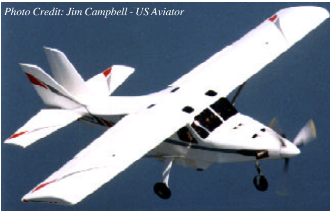
COMP AIR 10 Turboprop 8 to 11 Place Up to 2850 lb. Useful Cruise: 180- 200 mph