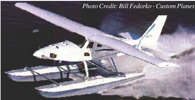
COMP AIR 8 Turboprop on SuperFloats